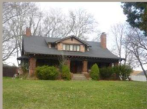
Wow! Historic home on 1.63 acres! Purchased for $325,500. Yes, it can be developed. Land values alone, supersede the purchase price.