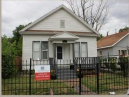
Investor purchase. Resold at over 30% Return on Investment.