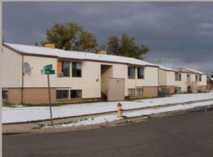
8 plex. Seller finance with only 10% down. Cash flows over $1000/month after all expenses. Rents are low.