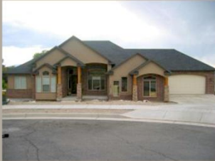
Relocation with Bank Owned Steal! Purchased $477,000 (listed $649k) 5300 sq. ft sits on .95 acre