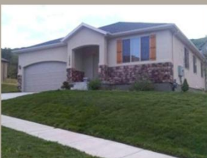
Investor buy and hold. Cash flows over $500/month, 10% return on investment.