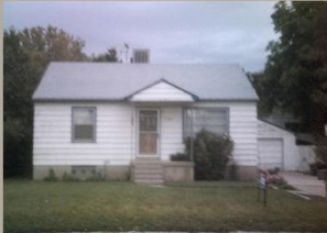
First Time Buyer. $148,500 house on .56 acre, lots alone sell for over $100k